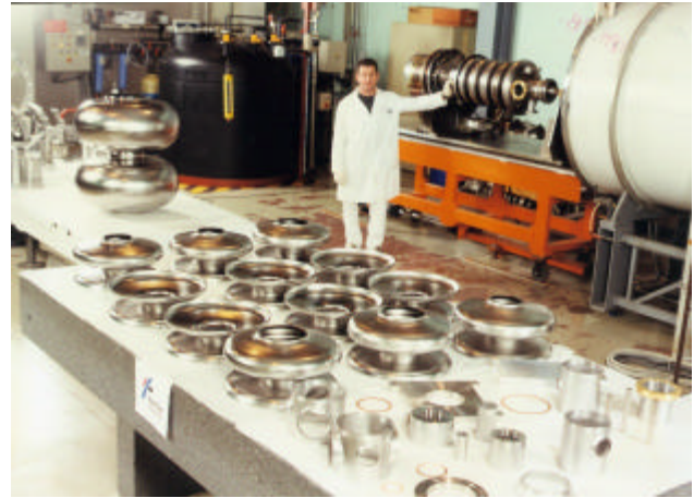
Figure 2. Fabrication of ED&D SCRF cavities at CERCA. In the foreground are “dumb-bells” formed by EB-welding of half-cells. In the background, a finished cavity is removed from the EB welder’s chamber.

Beam tube cut-offs and PC ports were made from Nb grade 250 material, while the HOM ports and RF pick-up tube were made from (reactor) RRR grade 40 material. Stainless steel CONFLAT® flanges were brazed to Nb tubes using a procedure developed by CERCA.