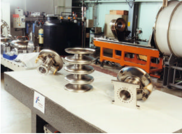
Figure 3. Beam tube cut-off and an intermediate part formed by EB-welding of dumb-bells prior to the final EB-welding.

Before each EB-welding operation, parts were thoroughly cleaned (buffered chemical polishing, 1:1:1), rinsed in ultra-pure water, and dried under ultra-pure N_2 . Adherence to this procedure was carefully checked and documented on the sign-off sheet in the traveller.