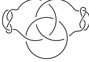
FIGURE 2. M_{K_1 K_2} before surgery

Theorem 10 (Meng and Taubes [MT]). In the situation above