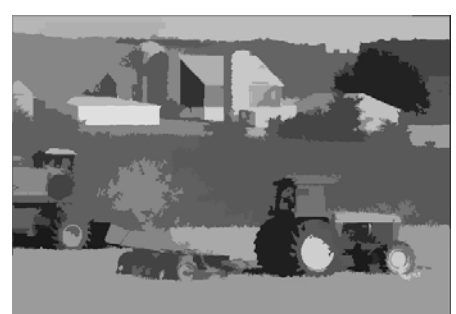
Fig. 5. Level 3 segmnt., 44 object-regions