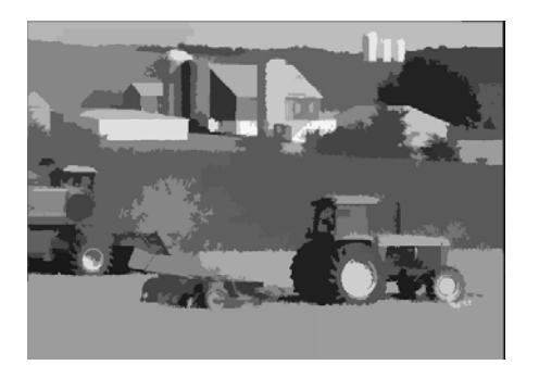
Fig. 6. Level 2 segmnt., 132 object-regions