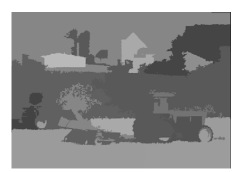
Fig. 3. Level 5 segmnt., 14 object-regions