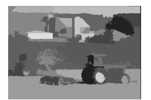
Fig. 4. Level 4 segmnt., 25 object-regions