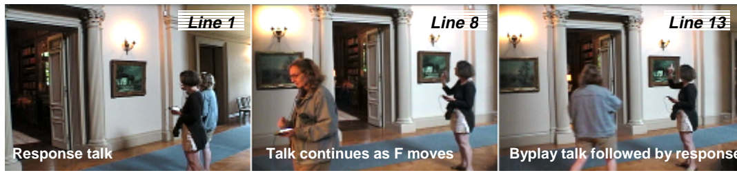
Figure 2. Visitors interact during movement and audio descriptions (line numbers refer to Excerpt I).