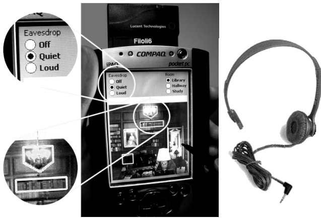
Figure 1. Electronic guidebook and headset.

interactions that were “less work” and “more natural” than those found in the previous study.