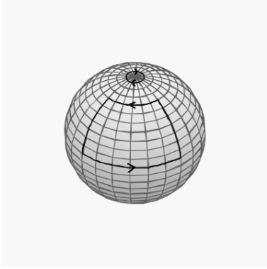
FIG. 2. The integration path on the sphere. The path shown at the center encircles a few fivefolds. The "total" path of the integration, encircling all twelve pentagons, includes two contours around the poles: negatively directed for the north pole (shown) and positively directed for the south pole (not shown).

Notice that for fullerenes with the full icosahedral symmetry (Ih) the combined flux turns out to be a sum of fluxes due to any pair of defects. Thus, the combined flux does not depend upon the arrangement of pentagons because any corresponding fragment of the lattice turns out to be of the class (1, 1) introduced in [9]. Finally, the continuous fields take the form