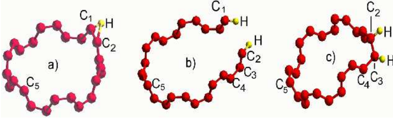
FIG. 1: Relaxed atomic structures for chemisorption of one H atom (a), and a pair of H atoms on the same layer (b) and on the adjacent layers (c) of the (6,6) single-walled armchair nanotube.