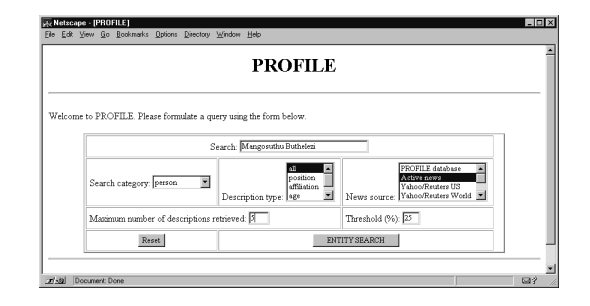
Figure 7: Web-based interface to PROFILE.

rently, the system has an interface to Reuters at www.yahoo.com, The CNN Web site, and to all local news delivered via NNTP to our local news domain.